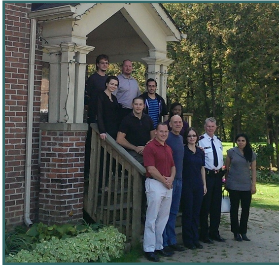
Gatehouse staff and volunteers gather with members of the 23 Division Youth Bureau during their visit to The Gatehouse.

The officers share a common theme of wanting to protect and reach out to children. The importance of family support and talking to their children was