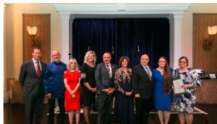
3rd Annual Healing the Voice Within. Hon. Hon. Peter MacKay, Keynote Speaker